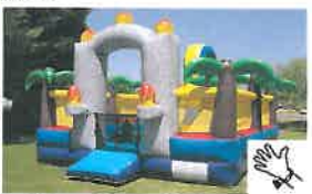
Dino Zone Bounce