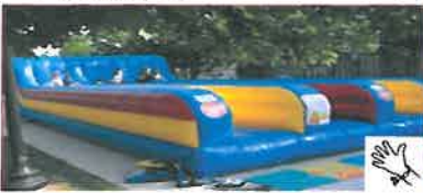
3 Lane Bungee Run