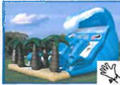
Beach Double Slide