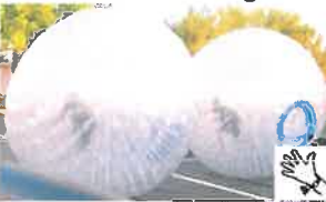
Human Hamsters Zorb Balls