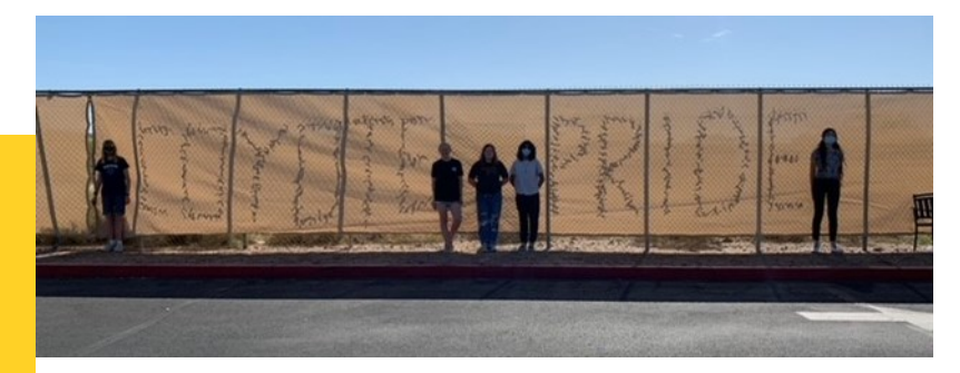
Students help fix Valley Academy's fence to show some "Coyote Pride." Thank you, students! The fence looks wonderful as we drive past it now.