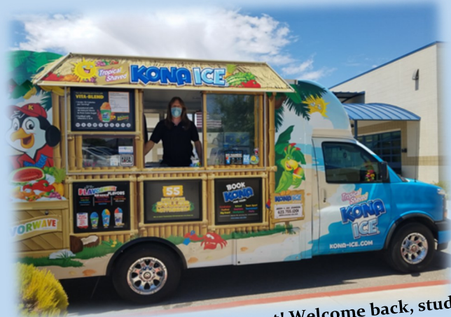
Kona Ice at Meet the Teacher event! Welcome back, students!